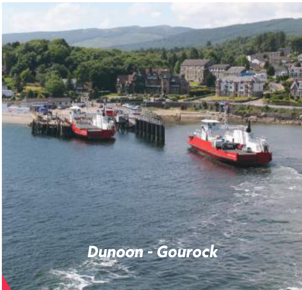
Dunoon - Gourock