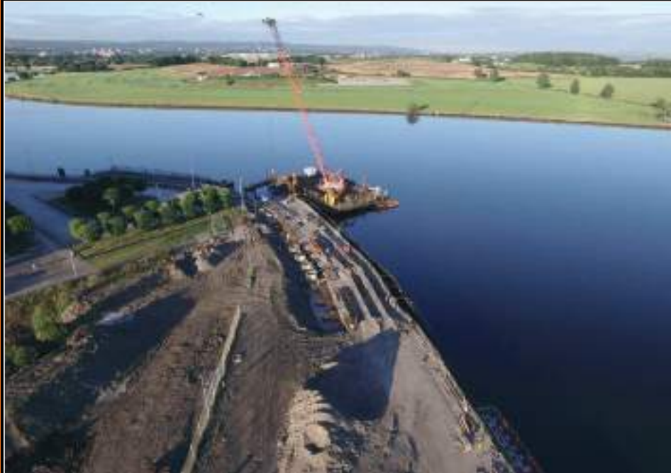
Queens Quay, Clydebank

George Leslie Ltd ... working on Piers ■ Harbours ■ Jetties... throughout Scotland