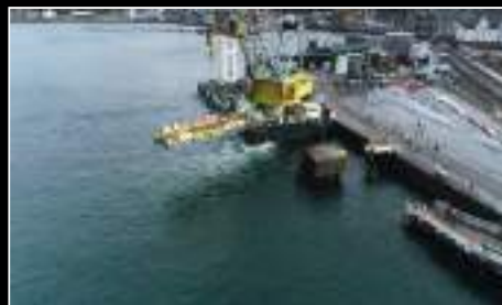
Oban No.1 Linkspan Replacement

Blackbyres Road, Barrhead, Glasgow G78 1DU T: 0141 881 9131 mail@georgeleslie.co.uk