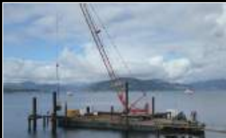
Western Ferries, McInroy's Point Terminal

George Leslie Ltd ... working on Piers ■ Harbours ■ Jetties... throughout Scotland